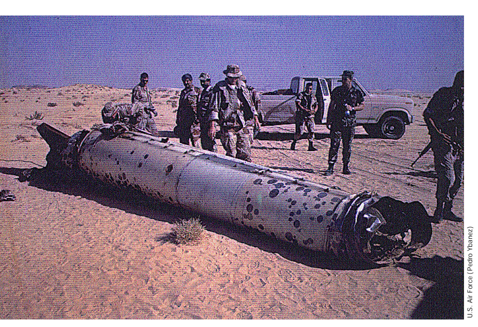
Examining Scud missile northwest of Riyadh.

upper tier ATBM capability the Aegis Vertical Launch System might be upgraded to accept a sea-based interceptor consisting of Standard—with new Lightweight Exoatmospheric Projectile (LEAP) hit-to-kill technology—or a compatible Army THAAD interceptor.