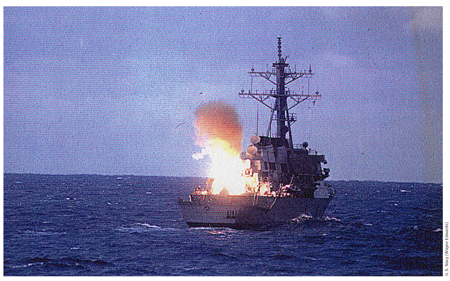
Missile launching from USS Arleigh Burke.

issues. These realities will undoubtedly challenge those planners responsible for unified direction of TMD. But if missile proliferation continues to worsen, TMD will become a joint wartime mission critical to future regional battlefields. Accordingly, a centralized and joint approach to organizing for TMD is being developed. Unity of command is a military principle of the highest order. Accordingly, TMD planning, development, and organization suggest centralized control for an array of reasons: