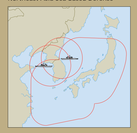
The two circled areas shown over the Korean Peninsula indicate the defense offered by SPY Radar coverage aboard Aegis missile cruisers. The two-tier defended area indicates the upper tier of the Aegis Vertical Launch System with propulsion options.